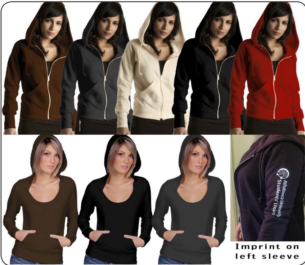
Imprint on left sleeve