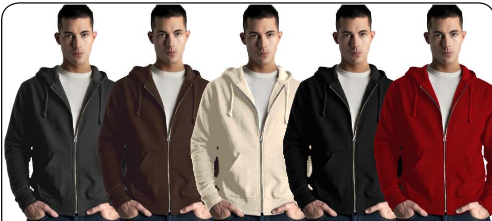
Imprint on left sleeve